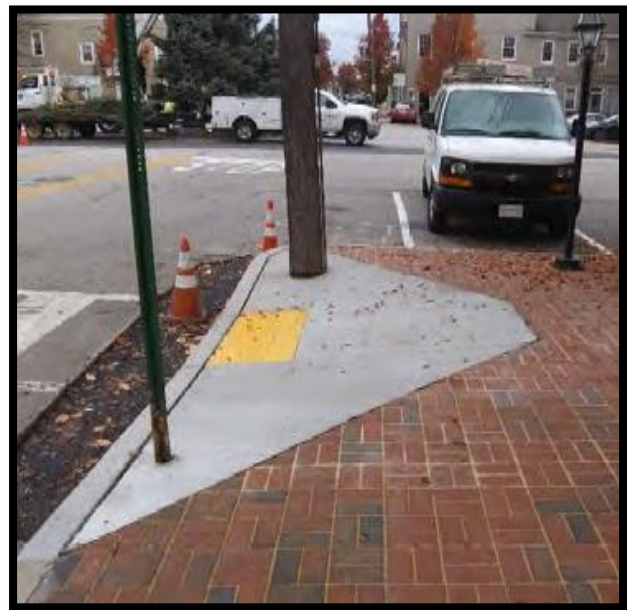
Rt 16 & N. Carlisle Street